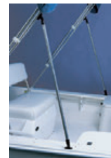
▲ Installation type