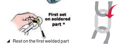
First set on soldered part *